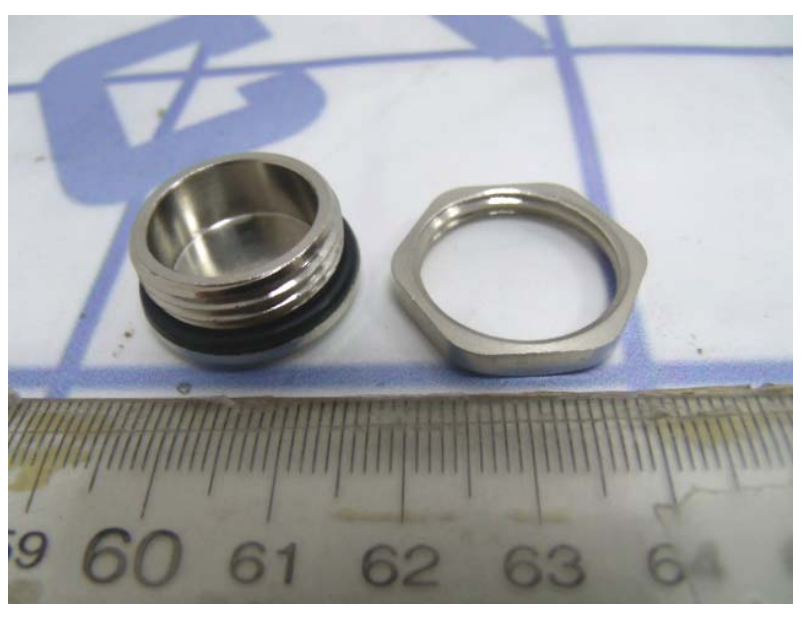
Figure 3 (External view-all components)