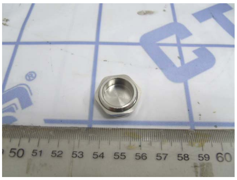
Figure 1 (External view-top)